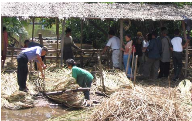
Figure 2.9. Waste from a manual deglazing process