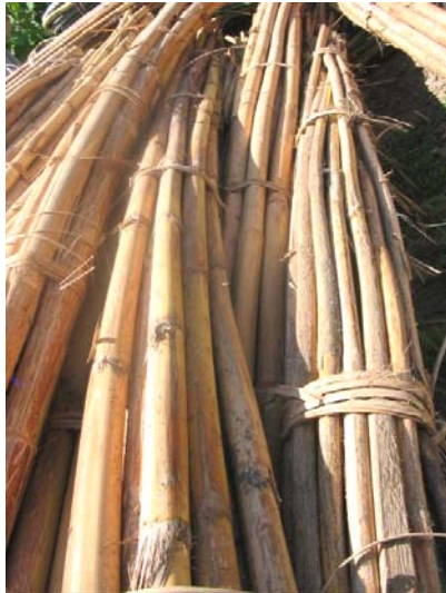
Figure 2.3. Scratched surface of large canes caused by dragging in transportation