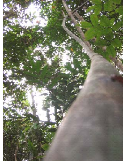
Figure 2.2. View of rattan canes climbing on the tree