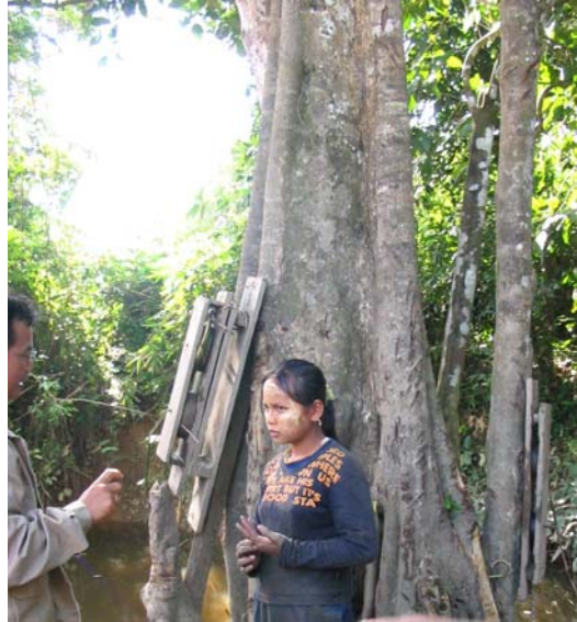
Figure 2.6. Discussion with rattan farmers