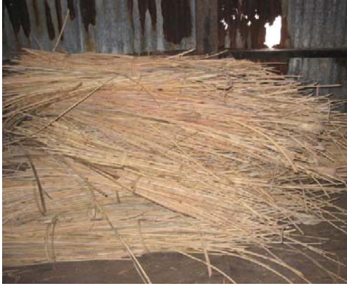
Figure 2.11. Rejected medium diameter canes after processing and selection