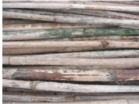
Figure 2.4. View of rattan canes attacked by fungi