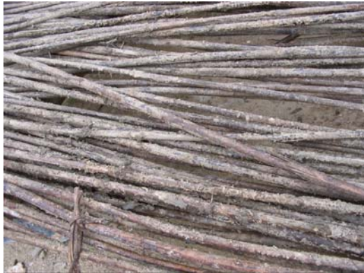
Figure 2.7. Rattan covered by muddy soils