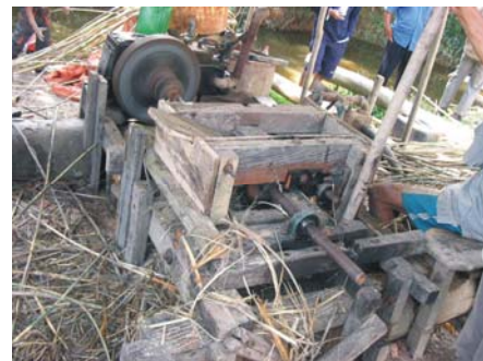
Figure 2.10. Waste after manual deglazing process