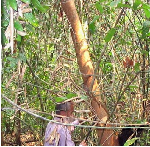
Figure 2.5. Selection of mature canes