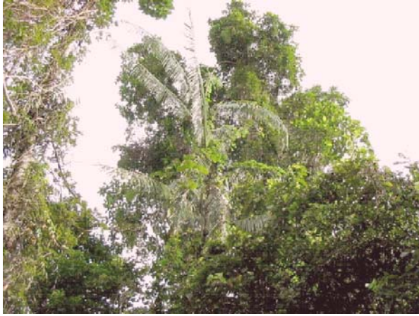
Figure 2.1. View of large-diameter canes reach on the top of tree canopy